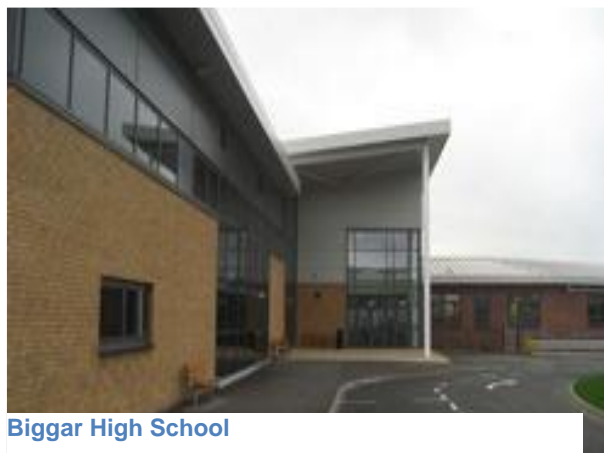
Biggar High School

Phone: 01899 222050 Email: office@biggar.s-lanark.sch.uk