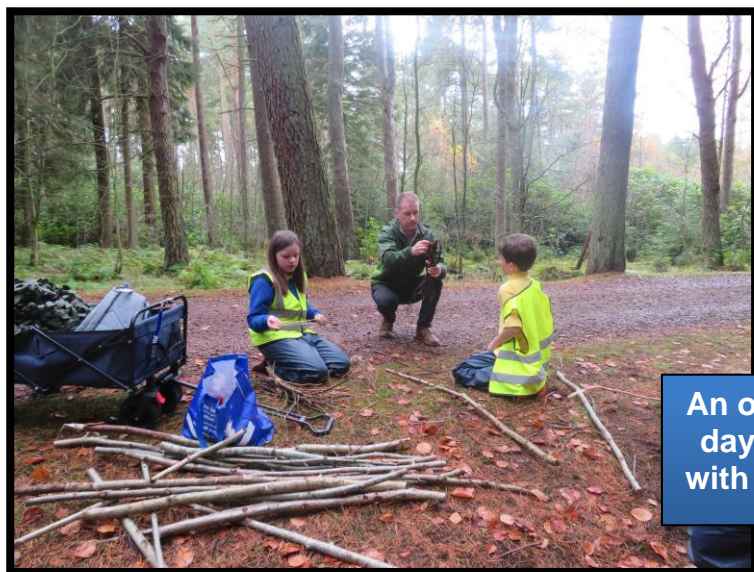
An outdoor learning day at the forestry with Wiston Primary

We will also provide you with information at this time on events designed to support P7 children before they move on to secondary school.