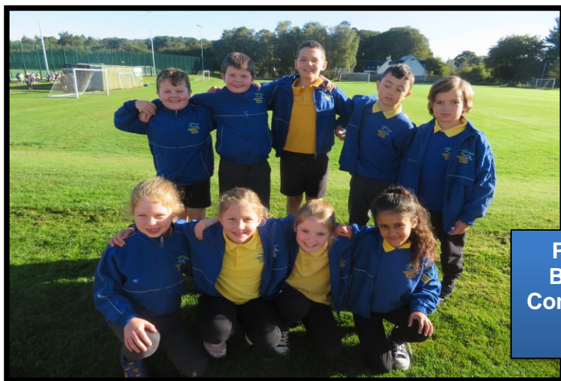
Primary 4/5 at a Biggar Learning Community Football Tournament