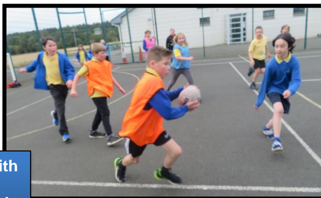
Rugby practice with coaching from Biggar Rugby Club