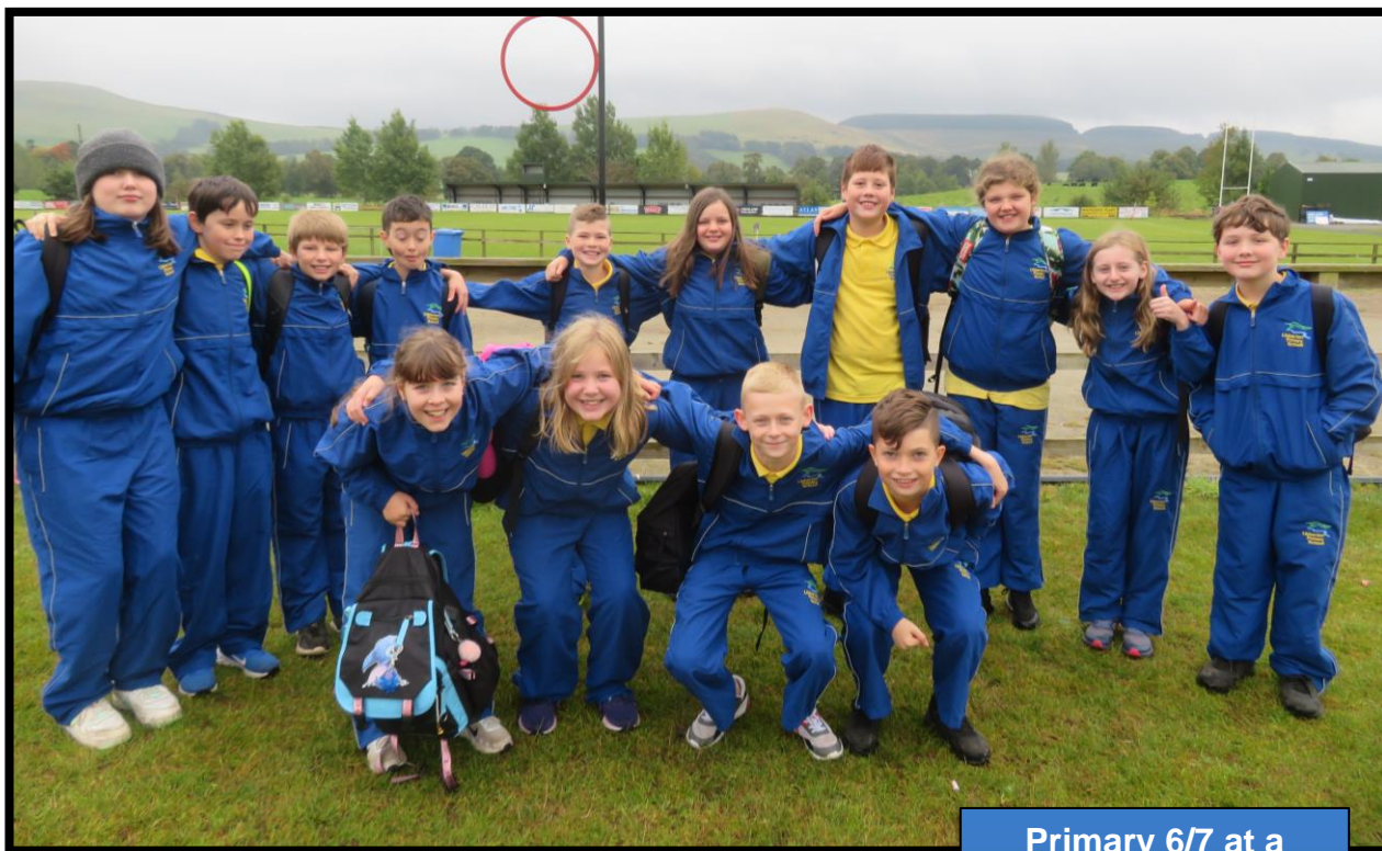
Primary 6/7 at a Biggar Learning Community Rugby Tournament

The priorities for all schools in South Lanarkshire are set out on the back page of the handbook.