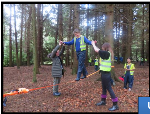
Using the slackline at the local forestry

Good regular attendance and timekeeping, polite manners, respect for others and a commitment to performing to the best of one's ability are all encouraged.