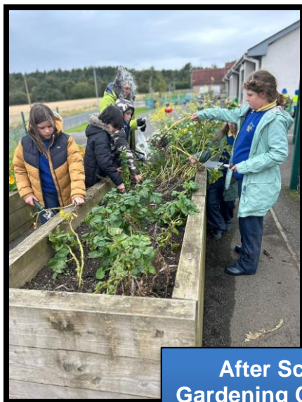
After School Gardening Club with parent helper

We strive to keep the school open during term-time. However, there may be instances such as severe weather or power failures that could affect the school day. In such cases, we will inform you as soon as possible through text messages and our social media channels.