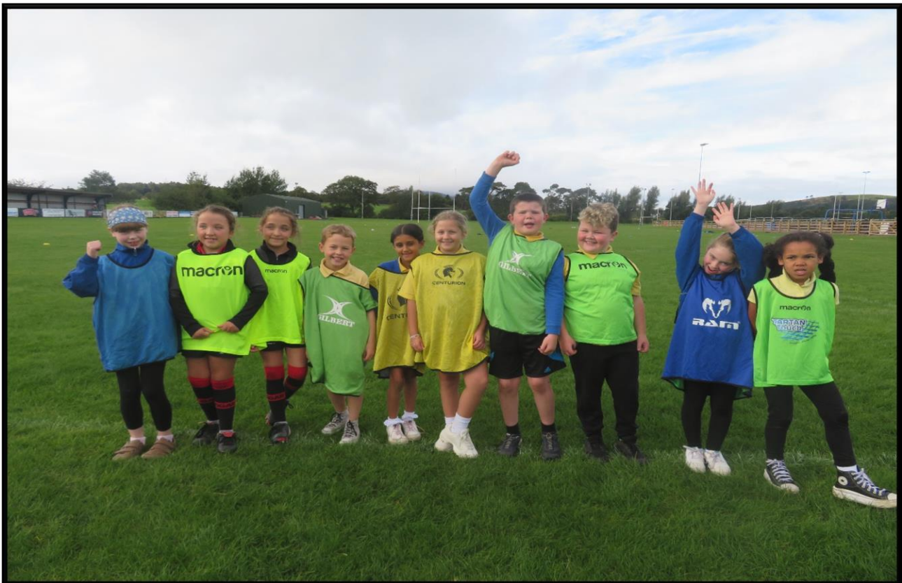
Primary 4/5 at a Biggar Learning Community Rugby Tournament

For Education Resources this means delivering services of the highest quality as well as striving to narrow the gap. It is about continually improving the services for everyone at the same time as giving priority to children, young people, families, and communities in most need. The priorities for schools and services are set out in the Education Resources Plan which confirms the commitment to provide better learning opportunities and outcomes for children and young people. This is available at Education Resources Plan 2025/26 Education and learning - South Lanarkshire Council